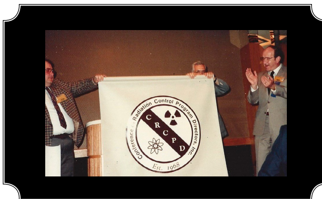
Celebrating a new banner at the 1986 Meeting in Charleston, West Virginia

When I read this, I thought of other times that we have cooperatively shared information and resources: following the tsunami and reactor accident at Fukushima, preparing for emergency situations, medical event sharing and analysis, just to name a few. So here we are, in the “next” century and celebrating the legacy of the organization that these folks and others formed 50 years ago and carrying on with the obligations.