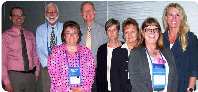
Board of Directors 2018-2019

We extend to each of them a hearty welcome and we look forward to their many contributions over the next three years.