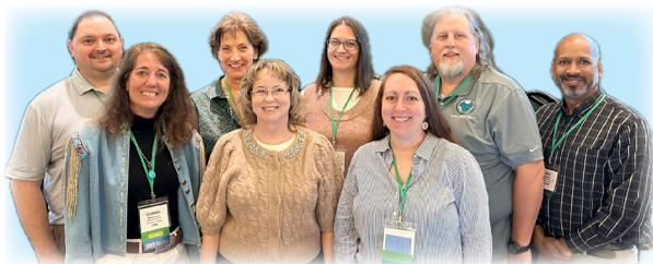
E-25 Committee on Radon at the 2025 Radon & Vapor Intrusion Symposium